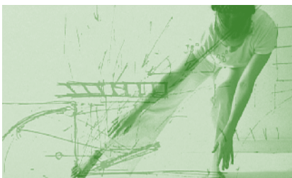
Klaus Seeuwald, (In)Space