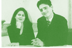
Duo: nota bene