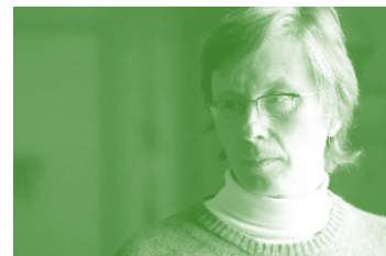
Georg Friedrich Haas, Universal Edition AG

Austrian composer Georg Friedrich Haas has a passion for sound itself: his music rejoices in the euphonious proportions