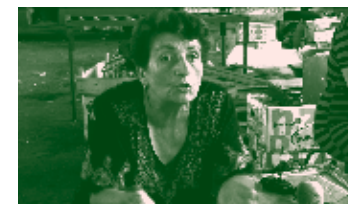
Socialism Failed England by Oliver Ressler

Venue & Info: Centre for Contemporary Arts, 350 Sauchiehall St, Glasgow G2 3JD; www.cca-glasgow.com; www.ressler.at; www.documentfilmfestival.org