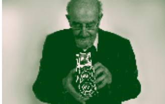
Wolf Suschitzky, Photographer & Cameraman

possible to see the world as a newborn does who, according to scientists, sees the world brighter, sharper.