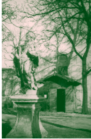
'Heiligenstadt' from the book Return to Vienna by Hilde Spiel