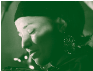
Großmütterchen Hatz Salon Orkestra

Venue & Info: London Green Note www.greennote.co.uk ; Manchester Jazz Club www.mattandphreds.com ; Penelopes, Sheffield www.penelopes.info