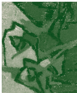
Spira // (1964) by Mela Hartwig-Spira, Neue Galerie, Universalmuseum Joanneum, Graz

Venue & Info: Austrian Cultural Forum London, 28 Rutland Gate, SW7 1PQ; T 020 7225 7300; E office@acflondon.org; www.acflondon.org