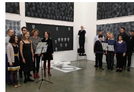
Musarc, 2013, MK Gallery

This new ensemble champions the compositions and stories of musicians who emigrated from Germany and Austria in the 1930s and 40s. It began as a research and performance project