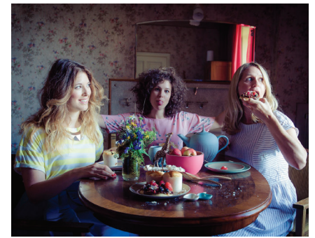
The Viennese Guerilla Bakery