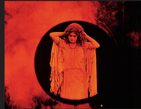
Film still from Film ist ...

Crossing Boundaries (Der Grenzgänger) , Austria, 2012, 90 mins, German with English subtitles, directed by Florian Flicker