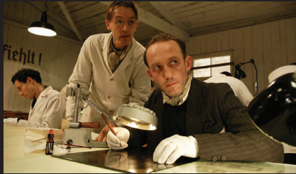
Film still from The Counterfeiters