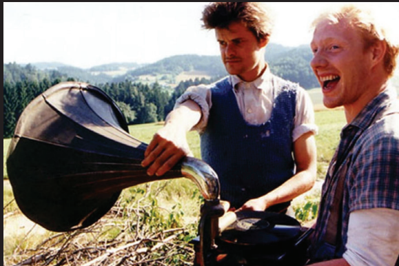
Film still from The Inheritors

The Inheritors (Die Siebtelbauern) , Austria, 1997, 90 mins, German with English subtitles, directed by Stefan Ruzowitzky