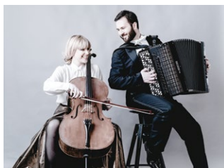
Duo Accord

Charlton House, Charlton Road, London SE7 8RE