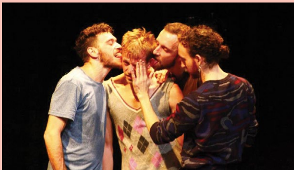
CieLaroque, Bluff

Jazz Proclamation celebrates the diversity of jazz. The international trio brings new life to songs by legends such as Jacques Brel,