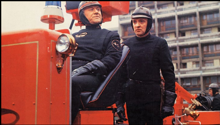
Still from Fahrenheit 451