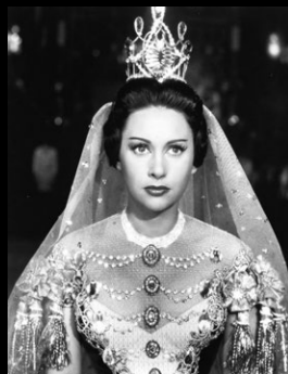
Still from Lola Montès , 1955

Our Summer historical mini season is dedicated to the Austrian actor Oskar Werner. The outspoken pacifist was drafted into the war shortly after making his stage debut at the Burgtheater in 1941. Following the war he returned to the stage and also began starring in German and Austrian films. By the time he starred in Max Ophüls' Lola Montès in 1955 he had become one of the best recognised actors in Europe. He became an international sensation in Truffaut's Jules et Jim , which was recently screened as part of CineClub's 1918 Historical Film Season. Werner and Truffaut's cooperation continued with films such as Fahrenheit 451 in 1966.