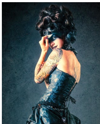
Opera in the City Festival

Bridewell Centre, 14 Bride Lane, London EC4Y 8EQ; www.opera-in-the-city.com