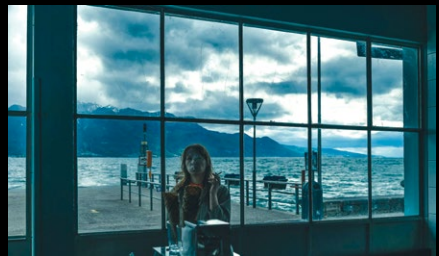
Still from Tiere